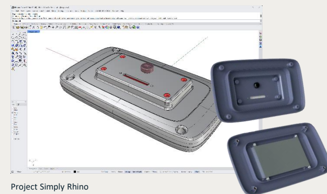
Project Simply Rhino